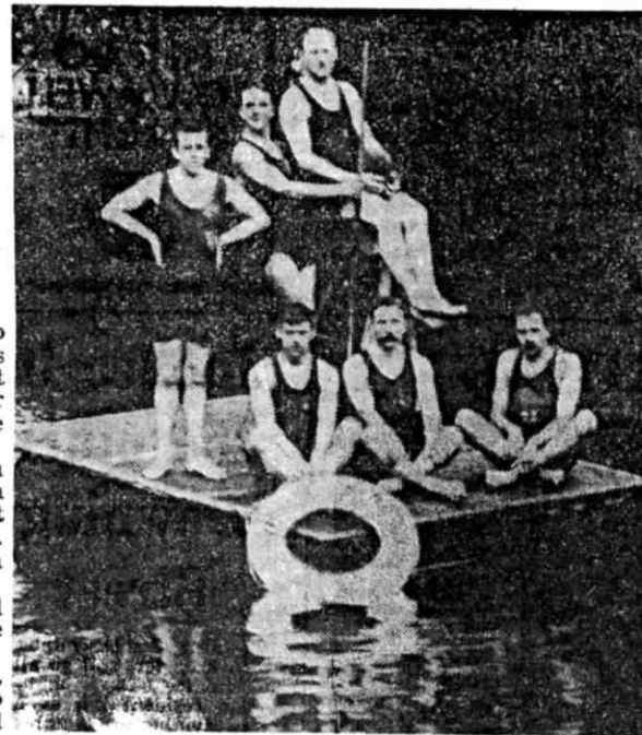
The pool was being re-open-

Chippenham Town Band attended and everyone must have had a good time, for the refreshments ordered by the